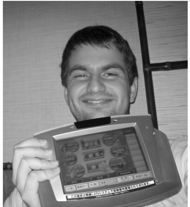
After an entire night of karaoke with a good friend from the US, I've looked better.

as an unplanned aftereffect of this strategy, everyone I associate with has become tired of karaoke. So, having found out that a large number of people are singing at karaoke joints by themselves (a phenomenon dubbed by members of the online community as hitokara ), I decided to jump on the bandwagon and tried it out for myself. I wasn't disappointed. But then how could I be—I love everything about Japan! Except natto (sticky fermented soya beans), I can't eat natto .