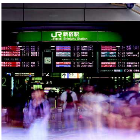
JR East's full-colour LED departure timetable for conventional line (2005). Designed by Shin-Yosha Corporation. (JR East)