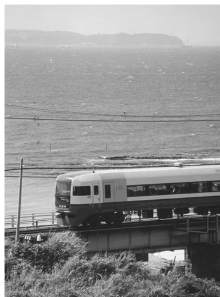
JR East's Series 255 Sazanami limited-express train (1994). Designed by Mr Suge of GK Industrial Design.