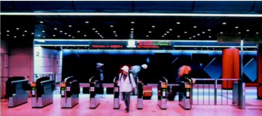
JR Hokkaido's Shin Chitose-kuko Station ticket gate (1994). Co-designed by Denmark State Railways and Yasui Architects & Engineers, Inc.