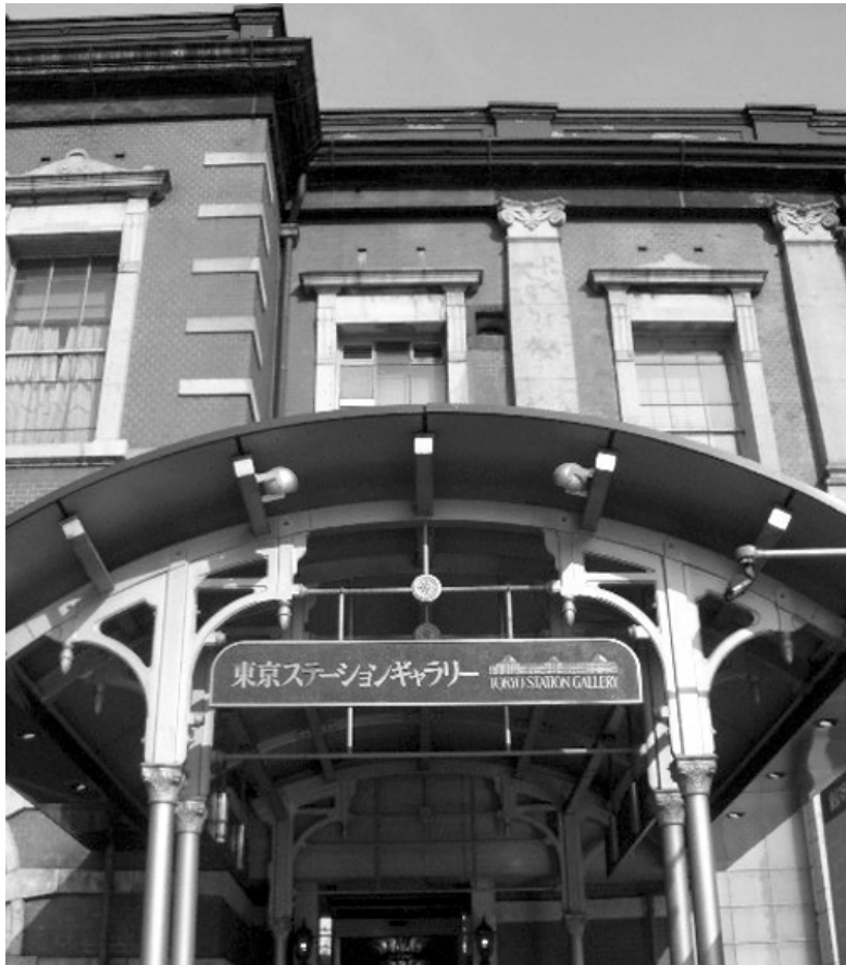
Entrance of Tokyo Station Gallery at Tokyo Station (1989)

Jury's Special Prize is chosen by internationally respected professionals evaluating the submitted projects. Japanese railway operators have received many prizes in various categories.