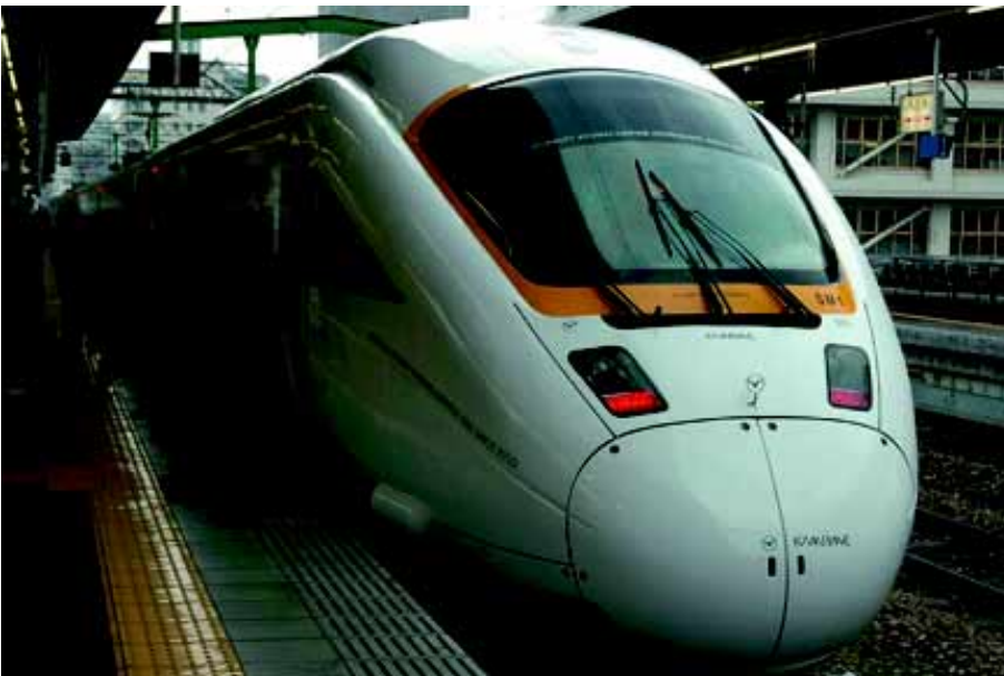
JR Kyushu's Series 885 Kamome limited-express train (2001). Also designed by Mr Mitooka of Don Design Associates.