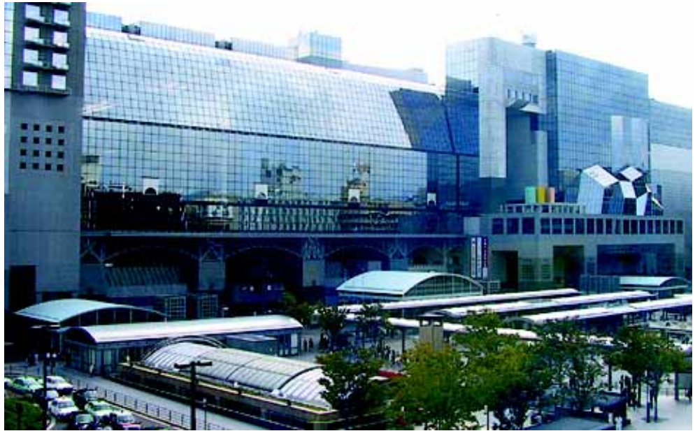
JR West's Kyoto Station (2001). Designed by Hiroshi Hara of Atelier Phi.