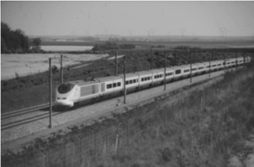
Eurostar developed by Alstom to solve interoperability problems