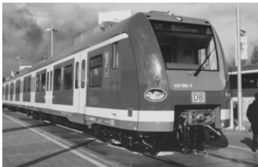
DB Class 423 developed by Bombardier for German commuter trains

The EU and EFTA member states have about 31,000 locomotives, 58,000 EMUs and DMUs (including coupled cars), 72,000 passenger carriages, and 656,000 freight wagons. Expansion of the high-speed railway network has increased the number of train sets on that network. Many trains are locomotive hauled—EMUs play a more dominant role in urban transit. More urban systems are being