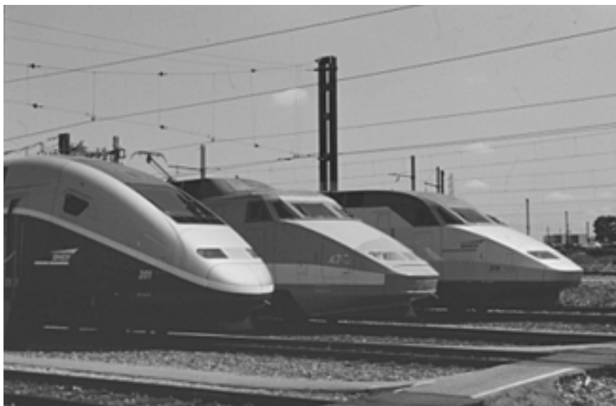
Alstom-developed TGV family