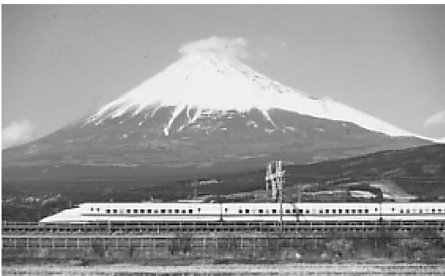
Series 700, basis for T700 serving Taiwan High Speed Rail, running on Tokaido Shinkansen

But rolling stock design has changed considerably since the 1980s. Locomotives, electric multiple units (EMUs), and diesel multiple units (DMUs) have computer systems, power-control electronics, advanced control systems supported by software etc., almost as standard. As a result, rolling stock has higher development costs and the manufacturing works require high-level facilities and technologies. The strengths of manufacturers in the West and Japan in these areas place them at an advantage. However, they still face a disadvantage—demand for new rolling stock has shifted from Europe and Japan, to China and SE Asia where strong economic growth is driving fever-pitch demand for high-speed intercity, freight, and urban transport. This explains why demand for new rolling stock is