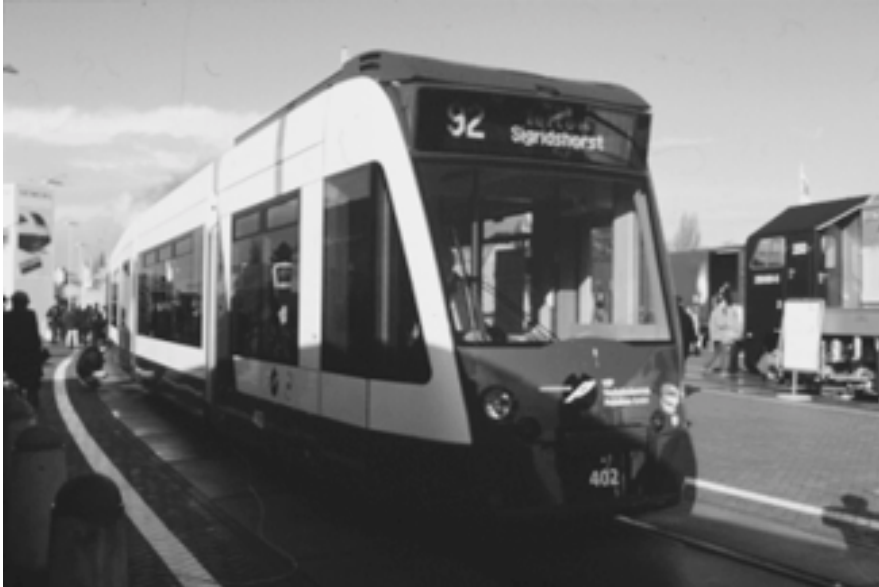
Potsdam LRV standard developed by Siemens