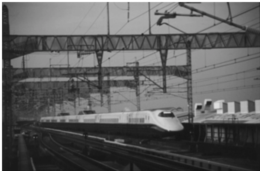
Japanese Series E2 shinkansen to be exported China as modified series