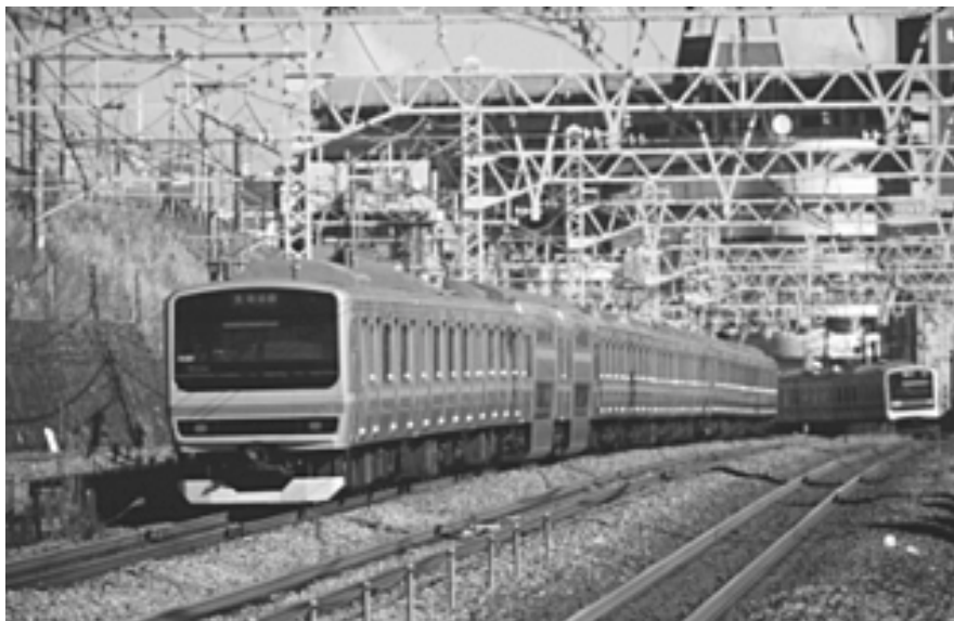
JR East's standard Tokyo commuter EMU developed in 1999 (more than 1500 carriages in service)

Globalization is rapidly changing the rolling stock manufacturing industry and attention is now focused on E Asia, especially China. Manufacturers in S Korea and China are establishing ties