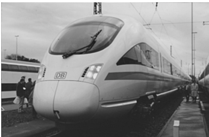
German tilting ICE developed by Siemens and Bombardier