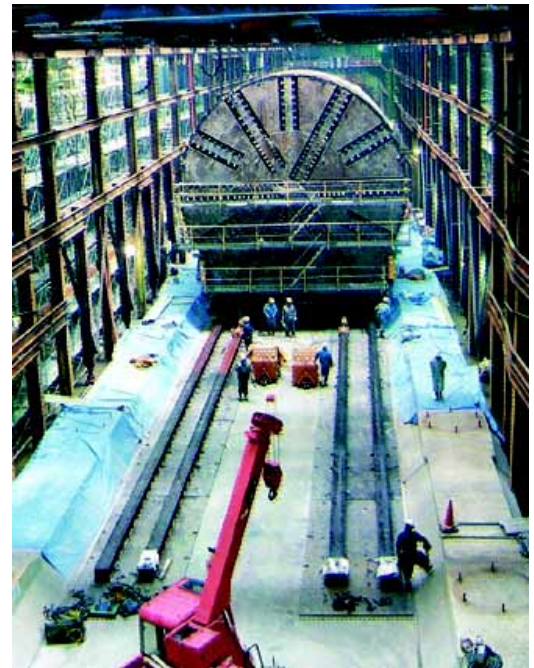
(JRCC, Tokyo Regional Bureau)