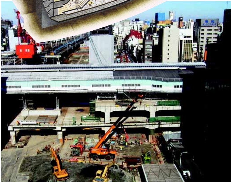
(JRCC, Tokyo Regional Bureau)