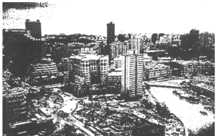
Cut-and-cover construction at Sengkang Station (left) and View of Clarke Quay Station (right) on North East Line