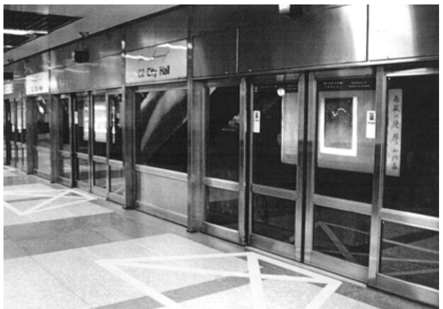
Platform screen doors