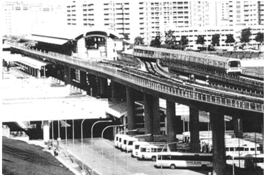
Woodlands MRT Station