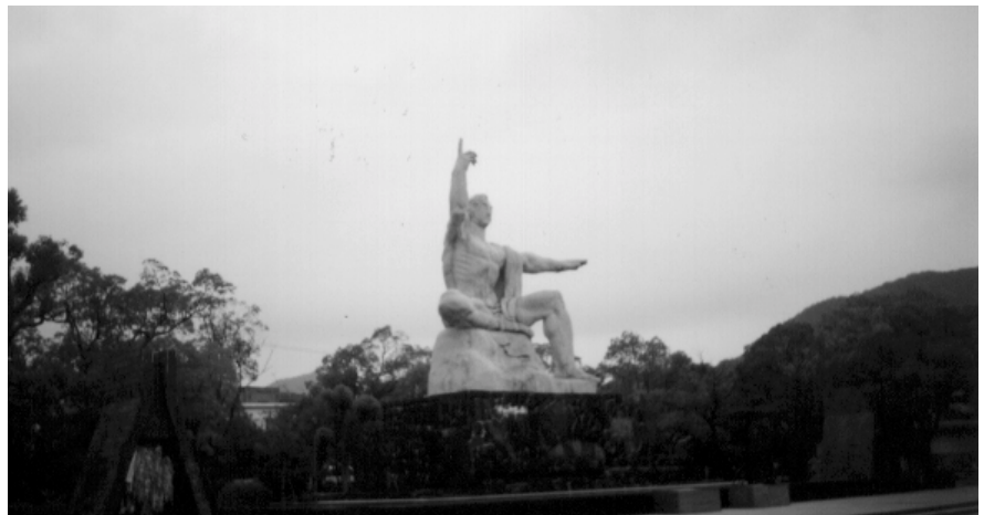
■ Peace Statue, Nagasaki