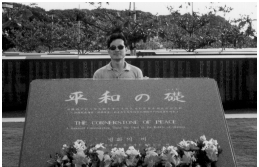
■ The Cornerstone of Peace (Heiwa-no-ishiji) in Heiwakōen, Okinawa

Our next destination was Hiroshima. In Okinawa and Nagasaki, we easily forgot the war completely, while we were visiting peaceful sightseeing spots. However, after visiting the Atomic Bomb Museum in Hiroshima, I could not really enjoy the beautiful scenery of Itsukushima, or Miyajima, the 'Shrine Island,' one of Japan's three most famous scenic attractions, because everything I saw in the Museum lingered in my head. Actually, I have seen photographs of A-bomb-stricken Hiroshima many times before, but this time they made me shudder with their vividness. Not a few photographs were so horrible that I could hardly bear to look at them. When we left the Museum, I was full of