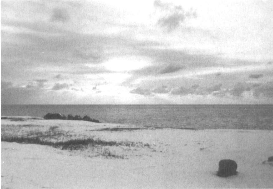
■ Sunset over Sea of Japan