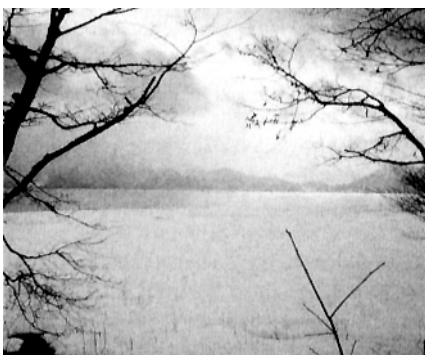
■ Lake Tazawa

Even the station that we stopped at on that particular line was a trip back to the days of