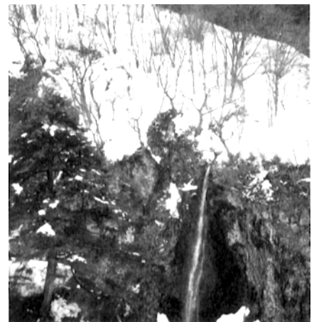
■ Shira Ito Waterfall

Before the trip started, I didn't like traveling by train because I didn't know what traveling by train was like. The trains were not crowded. In fact, on one train the conductor, my friend, and I were the only people on board. I was worried about some of the transfers in our itinerary, but even the local trains were always on time. In addition to being efficient, the cars themselves were shining testaments to the age long gone when machines were still forged by the hands of men. The trains, natural surroundings, simplicity of the stations, and friendly conductors all combined to make the trip an unforgettable experience. I saw more of Japan in that one week on the train than I could have seen in Tokyo in a year. It was on this trip that I fell in love with Japanese trains. More important, traveling by train gave my friend and me the opportunity to talk to other passengers. We achieved communication on a personal level which, in my opinion, does much more for the relations of two countries than any amount of diplomacy. ■