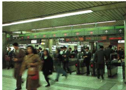
■ Commuters during rush hour 1.8 million passengers crowd the station every day.