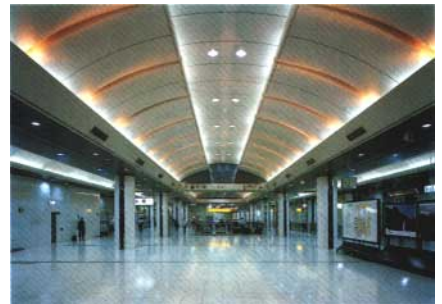
■ The concourse Keiyo platforms are underground.