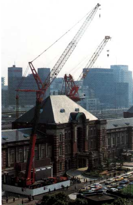
■ Renovation under way Tokyo Station being renovated to make space for the Hokuriku Shinkansen scheduled to open in 1997.