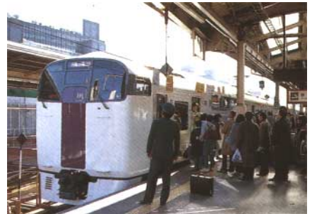
■ Double-decker commuter train at elevated platform.

Today, as Tokyo's equivalent of Grand Central Station, Tokyo Station serves about 3,800 trains daily on eleven lines including the Tokaido, Tohoku, Joetsu and Yamagata Shinkansen. It is the nation's fourth busiest station after Tokyo's major commuter terminals, Shinjuku, Ikebukuro and Shibuya and is the largest station in terms of number of trains, train-fare revenues, number of employees and total floor area.