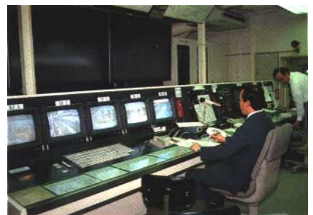
■ Safety control rooms Fire detection, air conditioning and other safety-oriented installations are monitored around-the-clock in three hazard control rooms located on the ground and underground floors.