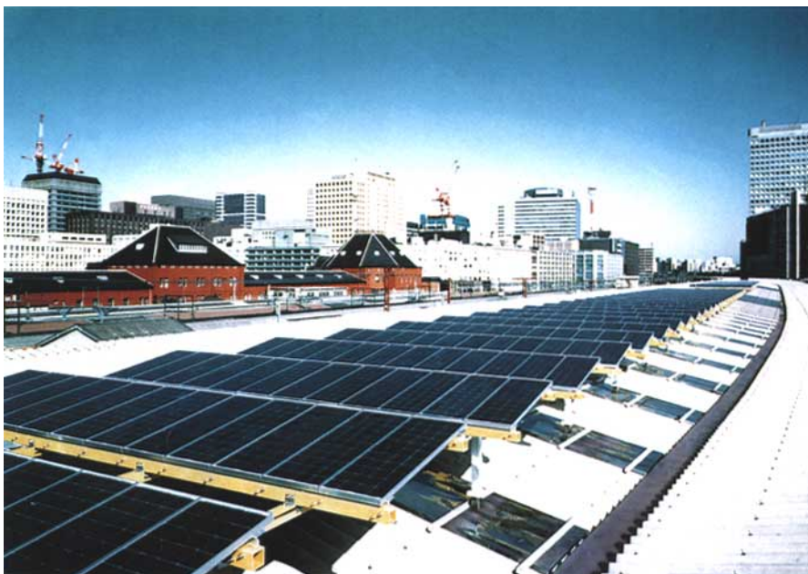
■ Experimental solar-power panels on platform roofs